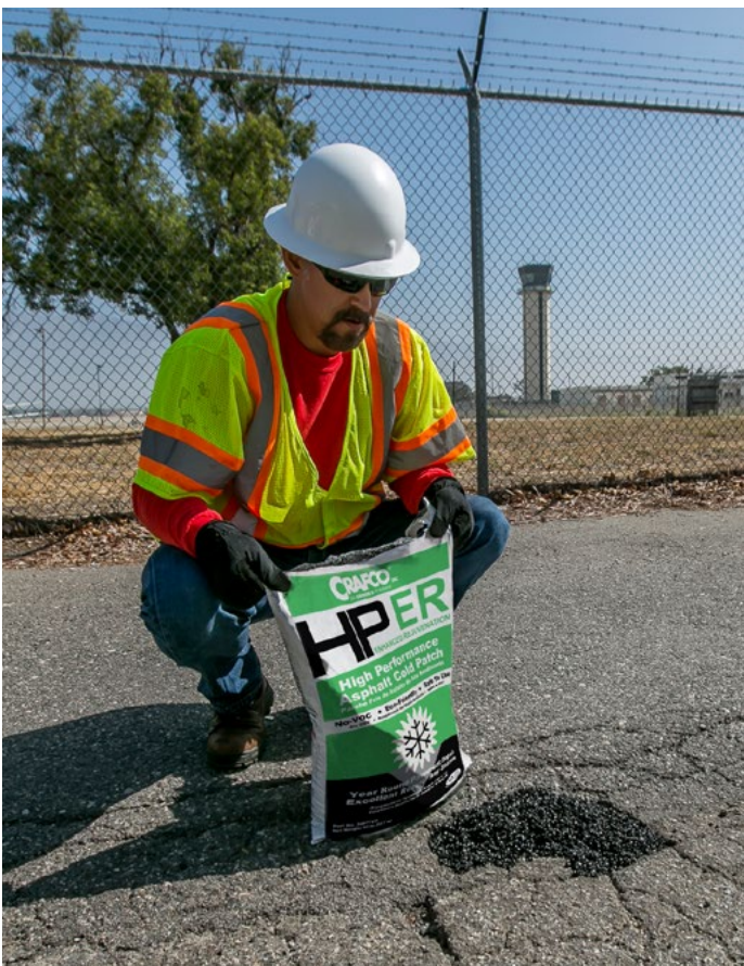
Repaired pothole with High Performance ER Cold Patch.