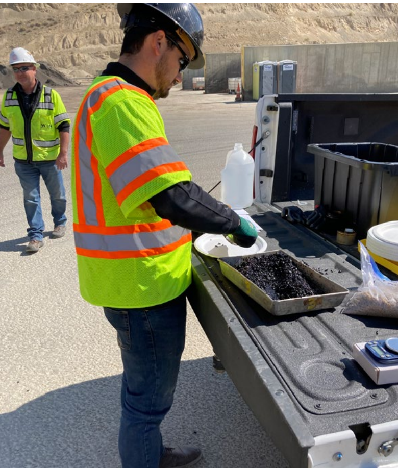
Blending analysis being performed by Crafcó Support Team.

Ultimately, Crafcó's HP ER Enhancer program is helping asphalt producers and end users streamline their processes, offering cost savings, environmental benefits and safety improvements from the plant to the job site. For more information, visit www.crafcó.com .