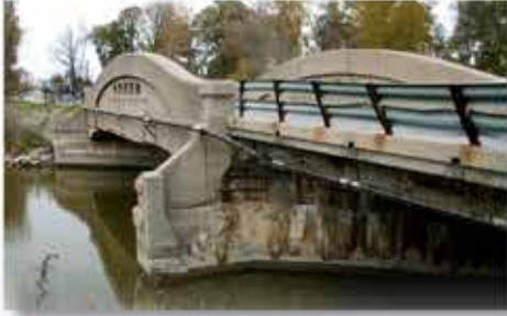
Bridge failure due to water penetration

The Ultraseal Bridge Deck Waterproofing System is a complete system using the right materials to eliminate water infiltration into the deck. This seamless, fully-bonded system protects the bridge superstructure from deterioration by preventing water from delivering corrosive materials into the deck. The Ultraseal Waterproofing System is a built-up, multilayer system used to protect the bridge deck surface from salt, chlorides, water penetration and other harmful destructive elements.